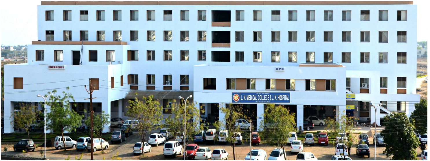
BUILDING OF J.K. HOSPITAL