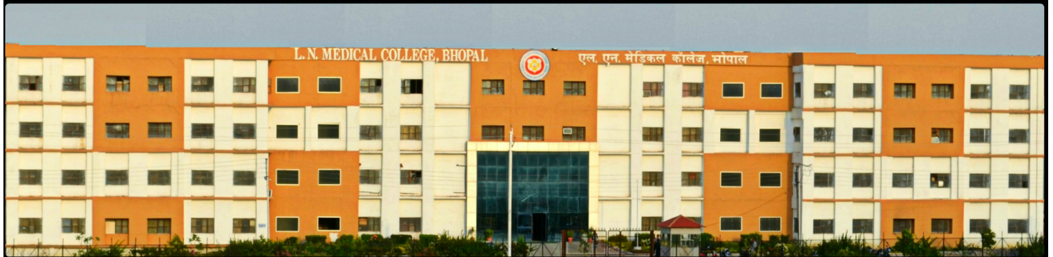
BUILDING OF L.N. MEDICAL COLLEGE