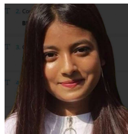
Tuba Ali Upgrad, 7.5 LPA