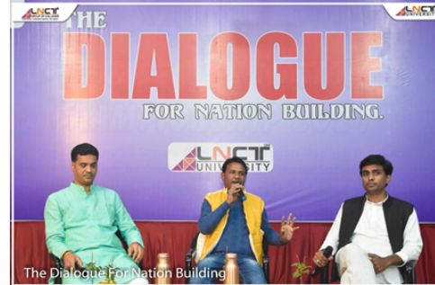
The Dialogue for Nation Building