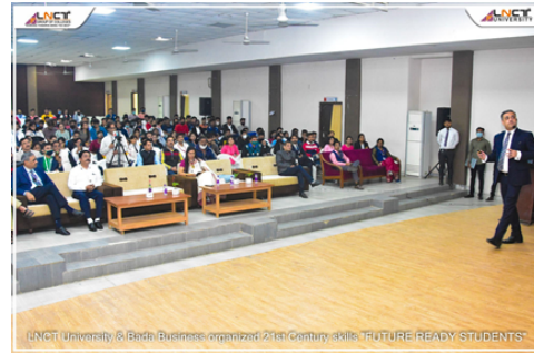
LNCT University and Bada Business organized 21st Century skills "Future Ready Students"