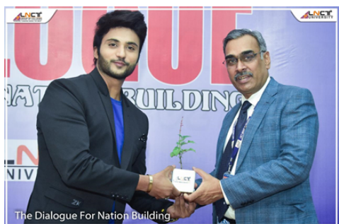
The Dialogue for Nation Building