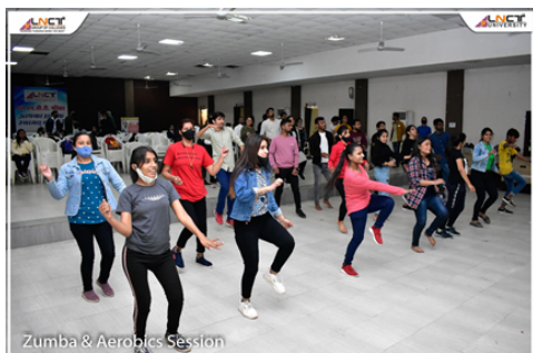
Zumba and Aerobics Session