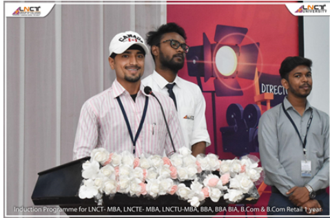
Induction Programme for LNCT-MBA, BBA-BIA, B-COM & B.COM Retail 1 year.