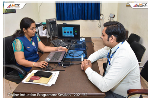
Online Induction programme Session 2021-22