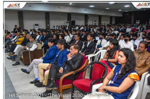
'HR Summit 2021' "The Vision 2030: HR Agenda"