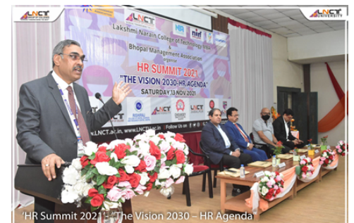
'HR Summit 2021' "The Vision 2030: HR Agenda"