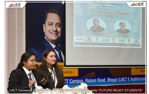
LNCT University and Bada Business organized 21st Century skills "Future Ready Students"