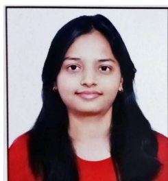
Deeksha Kushwaha Property Pistol, 7.6 lac