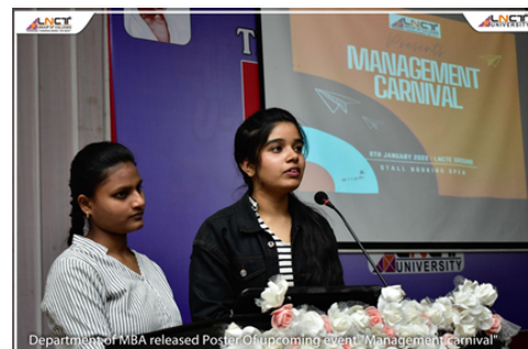
Department of MBA released poster of upcoming event "Management Carnival".