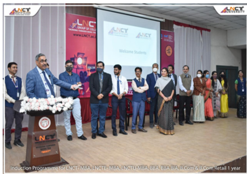
The Dialogue for Nation Building