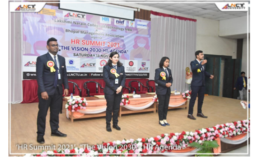
'HR Summit 2021' "The Vision 2030: HR Agenda"