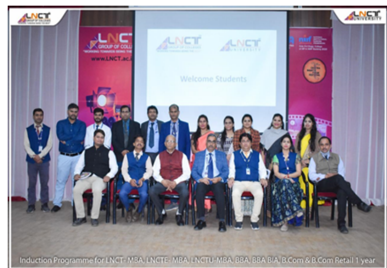
Induction Programme for LNCT-MBA, BBA-BIA, B-COM & B.COM Retail 1 year.

"The way to get started is to quit talking and begin doing." - Walt Disney