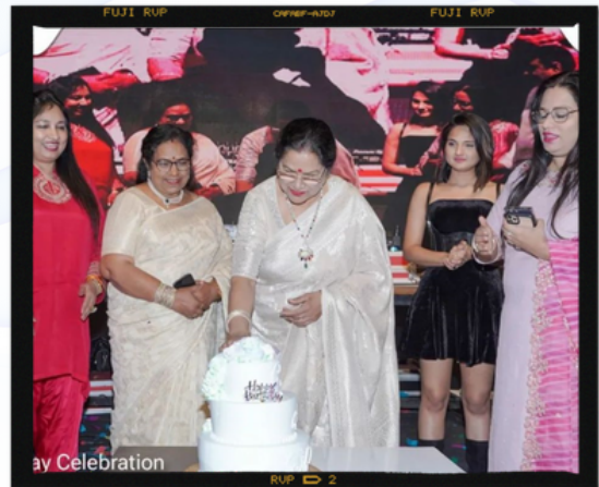
A jubilant fête of birth.