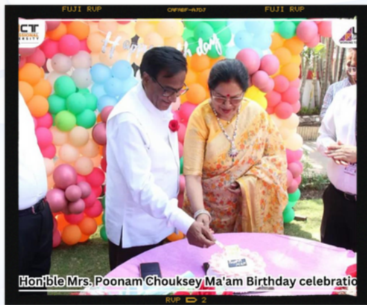
Founders's day celebration