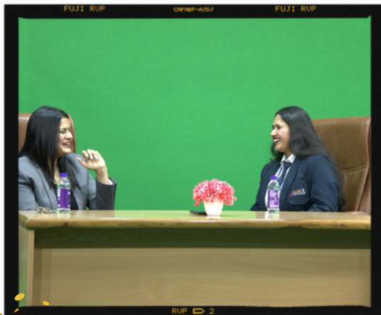
LNCT Jigyasa Podcast 2