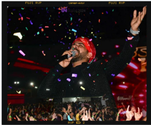
Udan khatola sufi night Techno-Cultural Fest