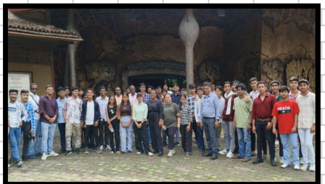
Tribal Museum visit of 1st year UG students