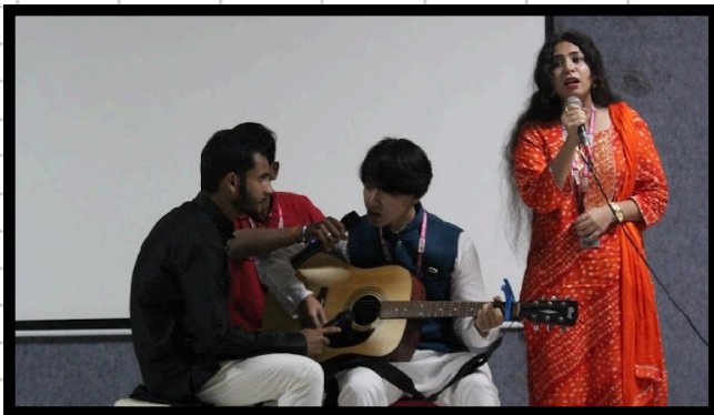
Singing Performance on UG orientation