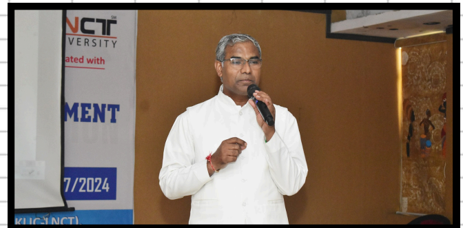
Expert talk on mental awareness for UG orientation