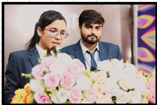
Quiz Activity for PG orientation program