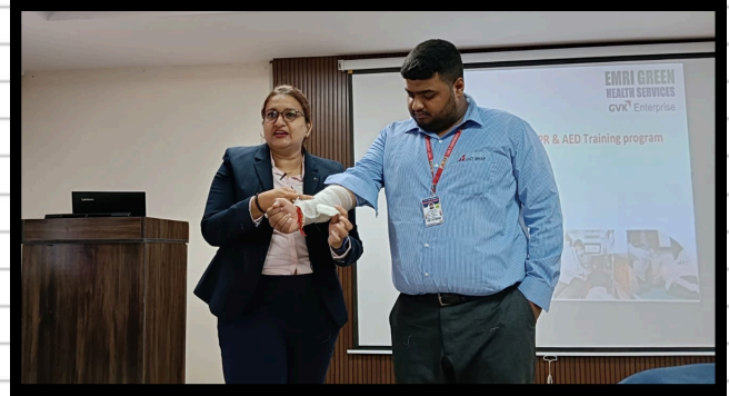
Young India Workshop