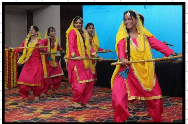
Dance performance for PG orientation program