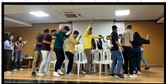
Ice Breaking Session for UG orientation