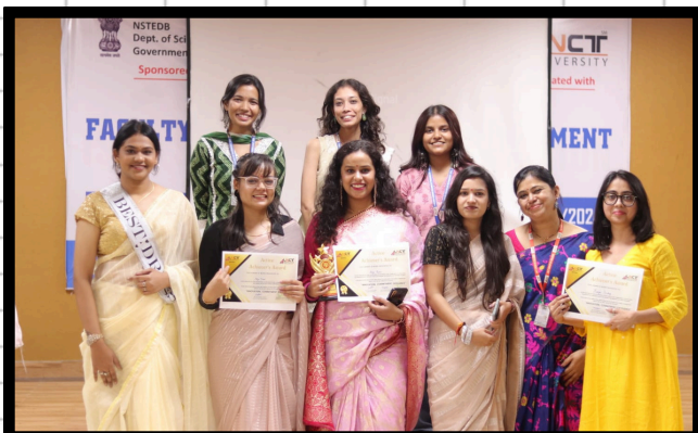
Transfer of legacy from old to new team Prabandhan