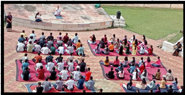
Yoga Day for UG orientation