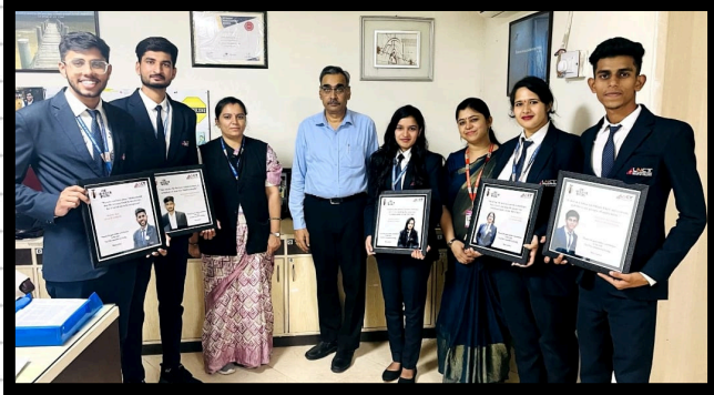
HR Club Achiever's