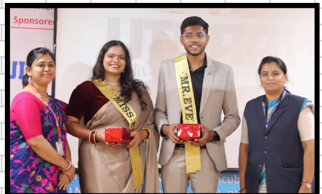
Mr. & Miss. Eve of Batch 2024