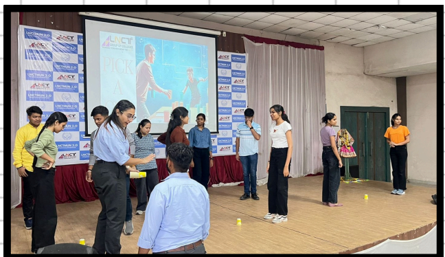
Brainstorming activity for UG orientation program