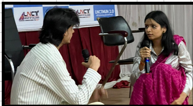
SKIT presented by UG students on Teachers Day