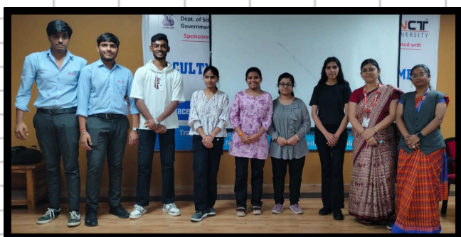
Winners of Time Management Games