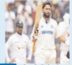
पेज-7 पूर्व भारतीय क्रिकेटर ने...