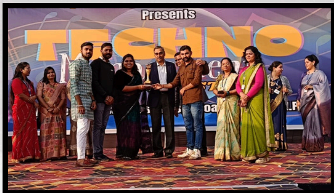
Best Stall winner at TMF 3.0