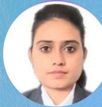
Kanchan Learning Route