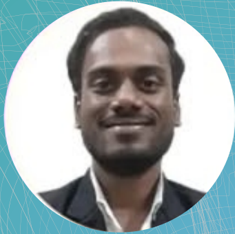
Robin Ruzar Learning Route