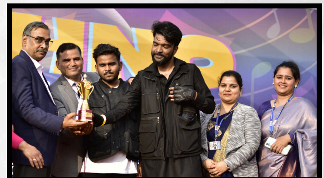
Duo Dance winner at TMF 3.0