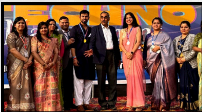
Rampwalk winner at TMF 3.0