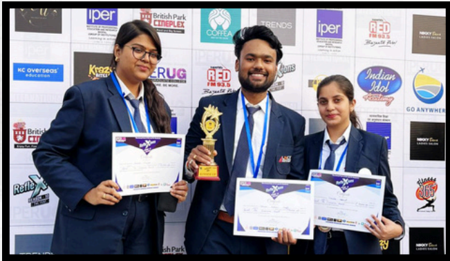
Winners of "Reflexions" at IPER College