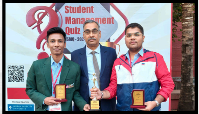
Winners of Student Management Quiz at Jagran Lakecity University