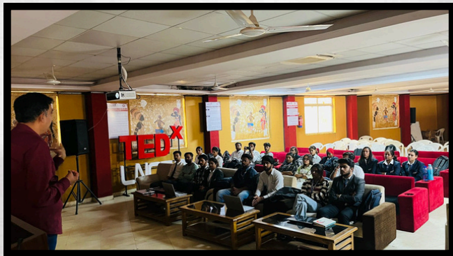
Expert lecture on descriptive and diagnostic analytics of HR Analytics for MBA 2nd Year