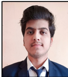
Omprakash Ahirwar Design & Editing