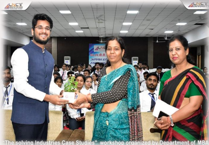
"The solving Industries Case Studies" workshop organized by Department of MBA

His use of the Amul case study as an illustration to illustrate how strategically switching Amul's B2B to B2C company allowed it to significantly recover during the COVID era was greatest.