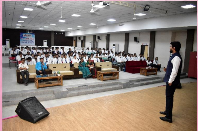
Solving Industrial Case Studies