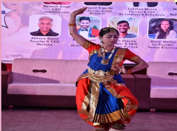
Youth Entrepreneurship Conclave