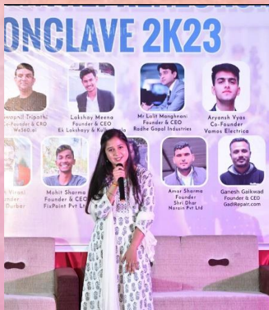
Youth Entrepreneurship Conclave