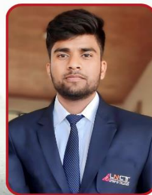
LAYOUT AND DESIGN MAYANK AGRAWAL