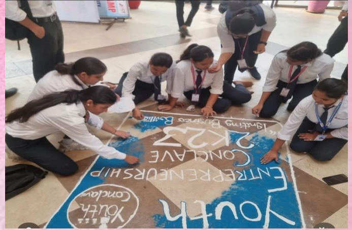
Youth Entrepreneurship Conclave