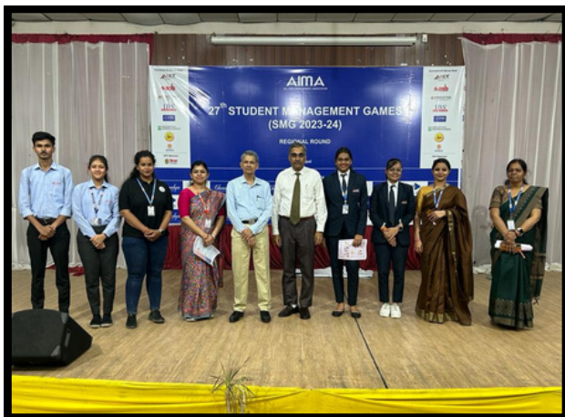
Release of Prabandhan