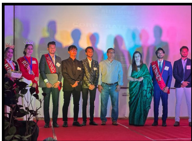
Winners of Fashion Show event 'Reflection' IPER College