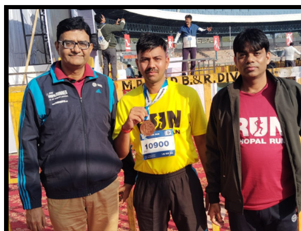
Winner of Run Bhopal Run