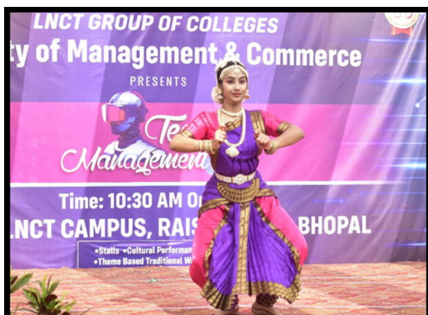
Techno Management Fest 2.0