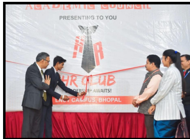
Inauguration of HR club