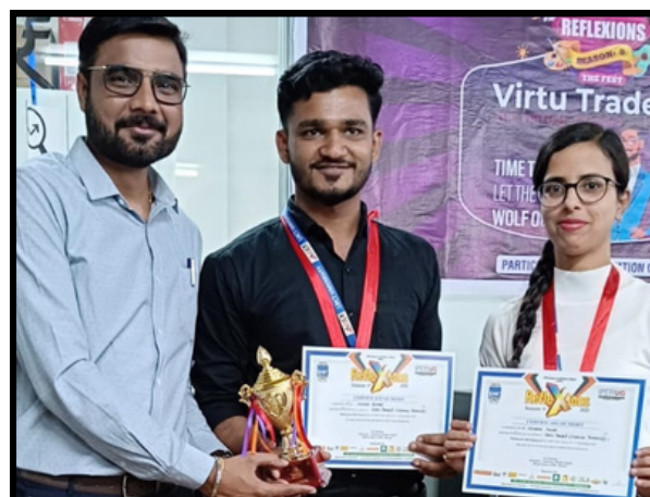
Winners of Virtual Trade event 'Reflection' IPER College